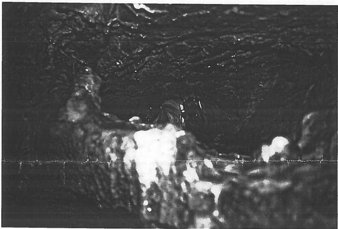
NIAL (LIVING JOKE) ADAMS STRUGGLING IN THE 'OLD ING' SUMP BYPASS