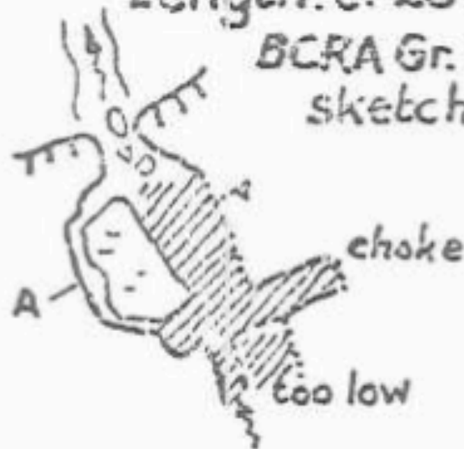
CROSS SECTION (x2 scale)

NGR SD 829289 Alt. c. 1625' Length. c. 20' BCRA Gr. 1. sketch