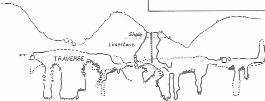
PROJECTED SECTION ON 136°